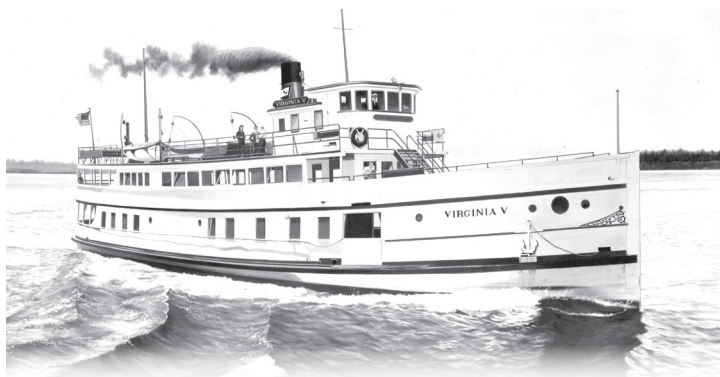
The S.S. Virginia V is a National Historic Landmark Vessel Steaming in the Pacific Northwest since 1922

PSRST STD U.S. POSTAGE PAID SEATTLE WA PERMIT NO. 1793